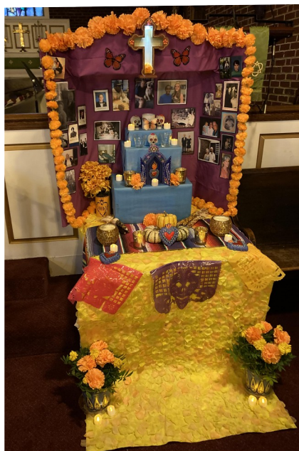
Ofrenda Dia De Los Muertos November 2023