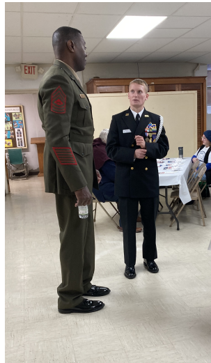
MSgt and a Cadet from DMA (Left)

(Lunch was prepared by the DelVets Women)