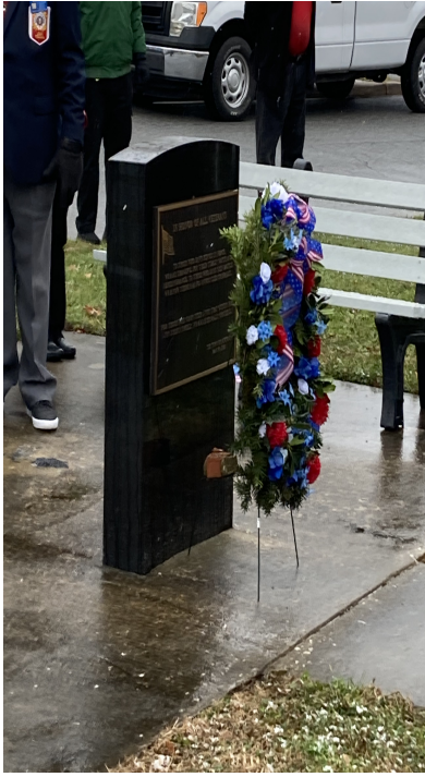
Pearl Harbor Day Ceremony December 7, 2023