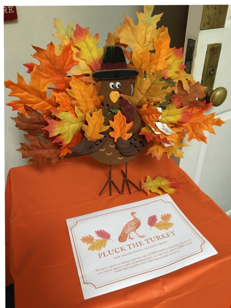
“Norm the Turkey” November/December 2023