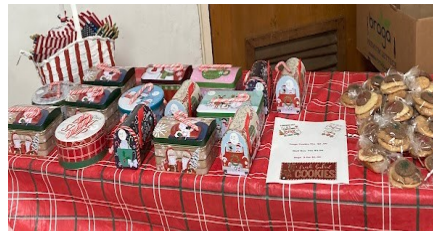
St James' Cookie Walk sold during lunch (Above)

(Lunch was prepared by the DelVets Women)