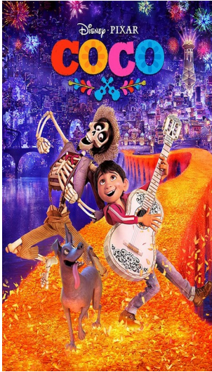
Showing of Coco October 2023